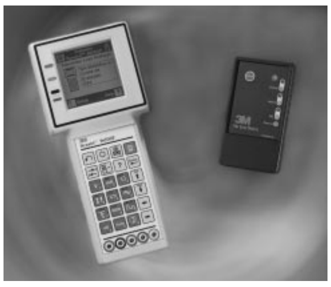
3M Dynatel 965DSP with 3M Far End Device