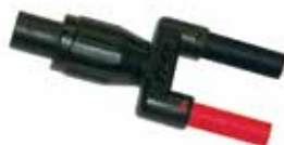
Banana (female) - BNC (male) Adaptor Catalog #2118.46 (optional)

**Available as special orders only. Contact customer service for current list price.