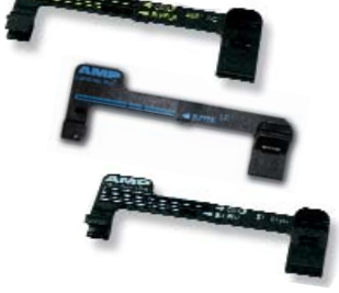
Cable Holders/Templates, SC, LC & ST-Style