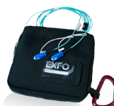
Soft Pulse Suppressor Bag SPSB