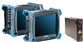
FTB-500 Four- or eight-slot platform for fiber characterization