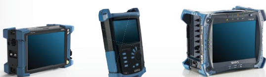
Platform FTB-2/FTB-2 Pro