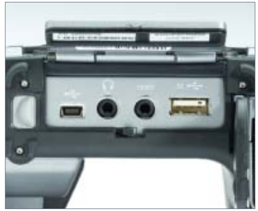
From Left to right: USB mini for PC image download, 4 pole audio for voice annotation, NTSC video, USB-A for memory stick image transfer