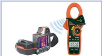
Manual data collection results in unnecessary complexity and risk. METERLiNK eliminates this problem by allowing the thermographer to quickly take a current reading on an electrical target and associate those readings with the corresponding targets stored in an infrared image