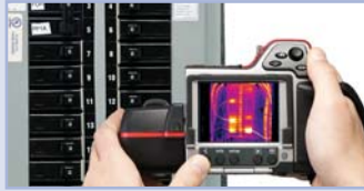
Infrared cameras quickly locate problems with electrical equipment

METERLiNK frees the Thermographer from the manual process of collecting field data