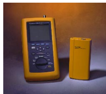
DSP-100 CableMeter main unit and remote.

See the Cable Test Accessories Guide for accessory information