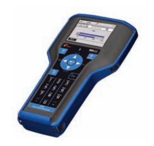
The protective rubber boot provides added protection in the field.

The 475 Field Communicator is designed, manufactured, and tested to very demanding specifications. It is ready to go wherever you need to go to get the job done.