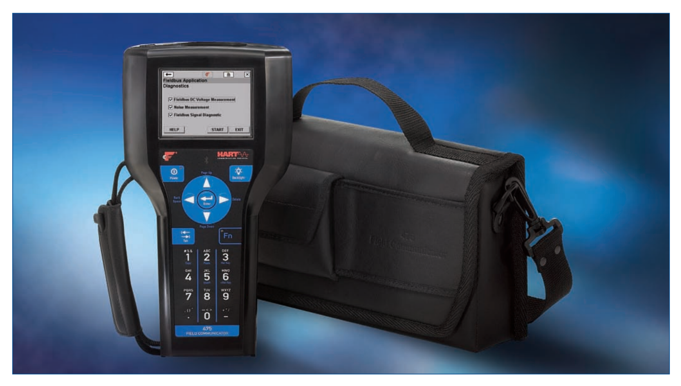
The 475 Field Communicator, with its handy carrying case, provides a single tool for configuring and diagnosing HART and FOUNDATION fieldbus devices.