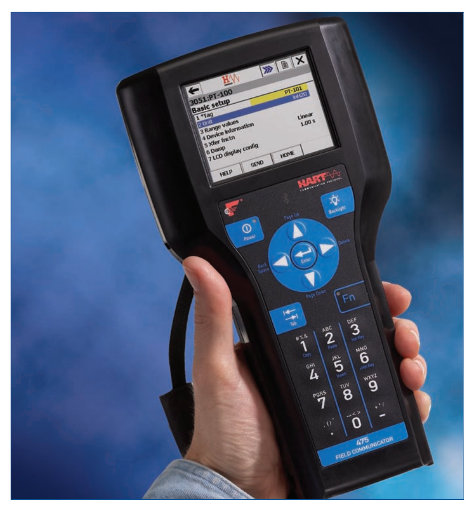
The 475 Field Communicator is designed to support all HART and FOUNDATION fieldbus devices from all vendors.