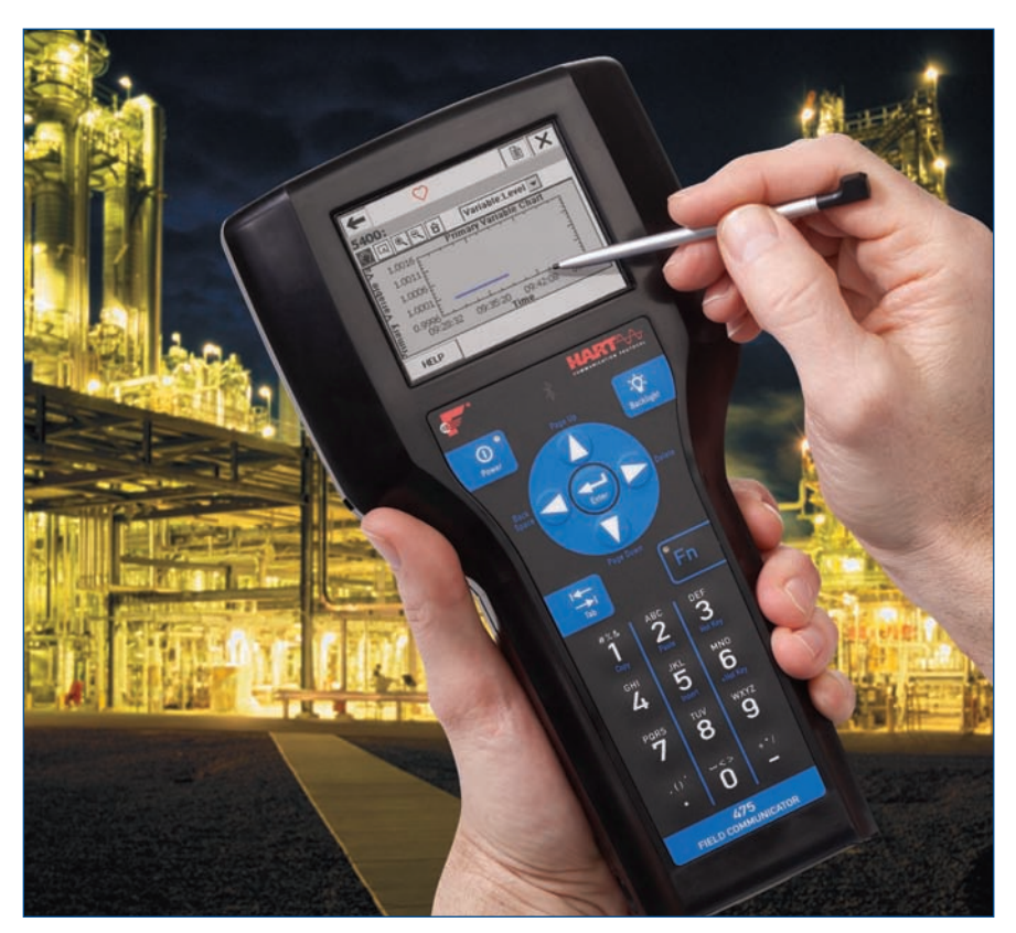
Designed not only for use on the bench, the 475 Field Communicator also enables you to do those tasks that just have to be done in the field.