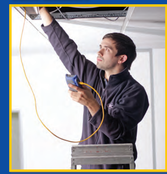
IT admin/security, troubleshooters & consultants