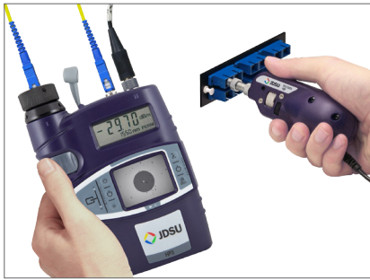
Inspect the Patch Cord with Integrated PCM and the Bulkhead with Probe