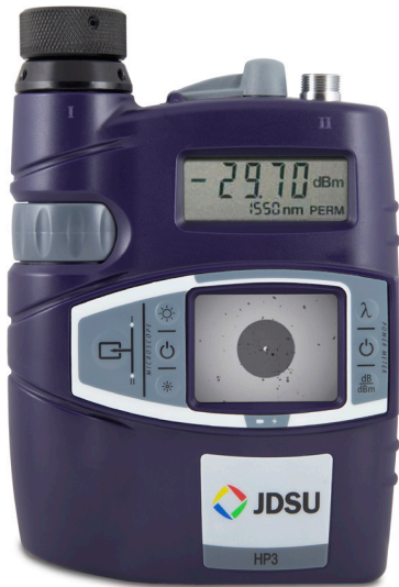
HP3-**-P4 Fiber Inspect and Test System with Integrated Power Meter and Patch Cord Microscope