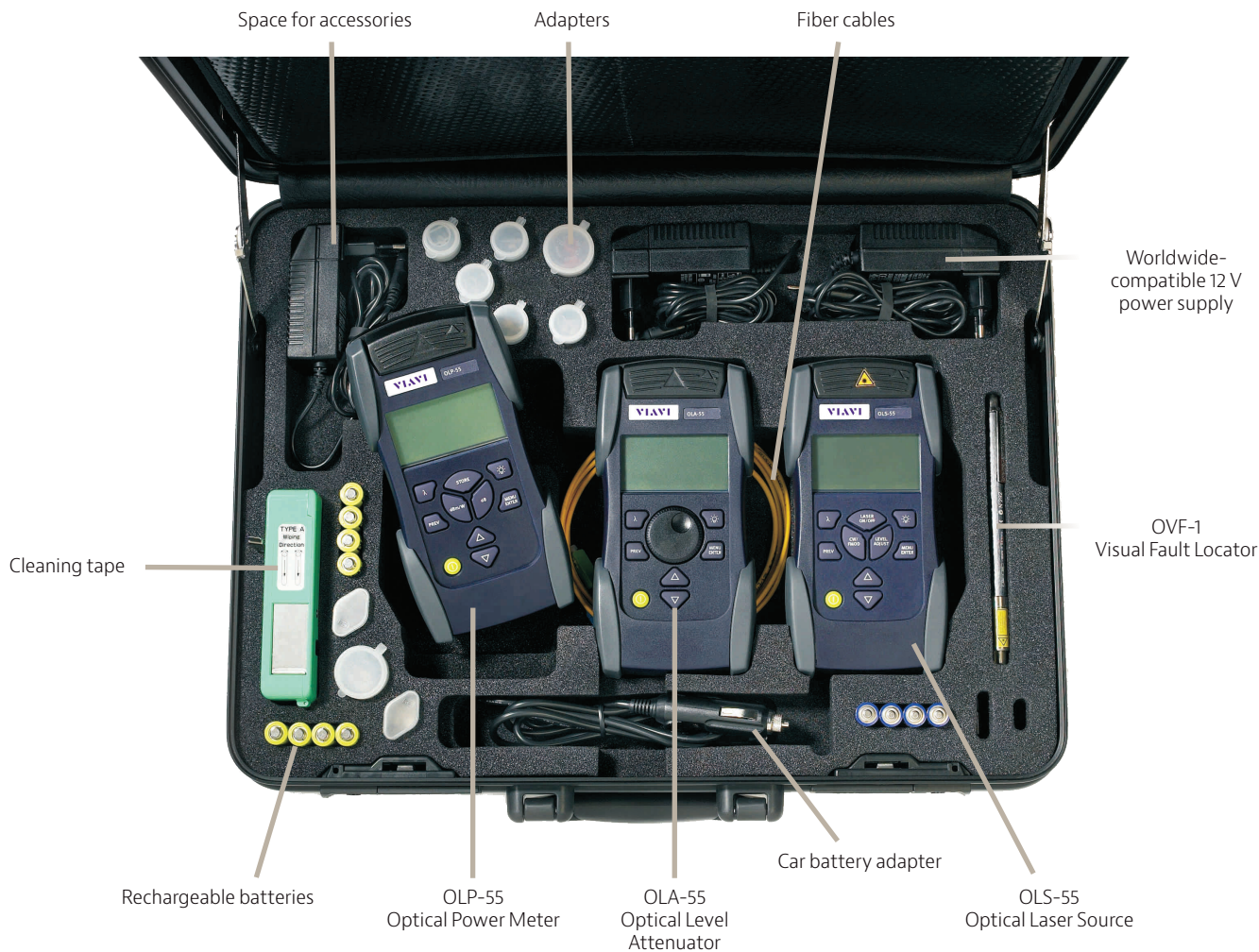
Figure 1. The hard case provides room for three instruments

The SmartClass OMK-55 may also include an optional SmartClass OLA-55 Optical Level Attenuator. Due to low differential group delay (DGD), the OLA-55 is suitable for up to 40 Gbps systems.