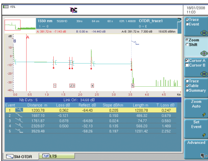
Trace and table displayed simultaneously