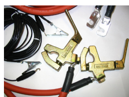
6220-756 10m Lead set

6220-755 supplied as standard with DLRO600-EN and DLRO600-FR