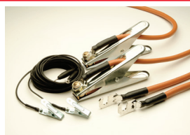
6220-755 5m Lead set (600 A)

2 x 50 mm 2 current leads with clamps and 2 x potential leads with clips.