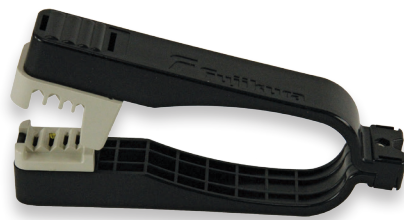
Cord Splitter Tool