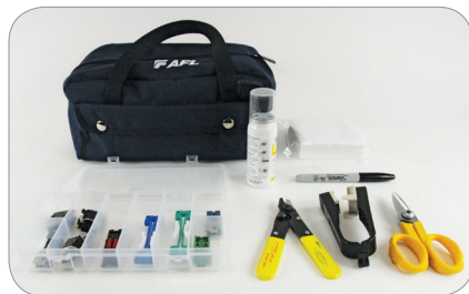
FUSEConnect Tool Kit Contents