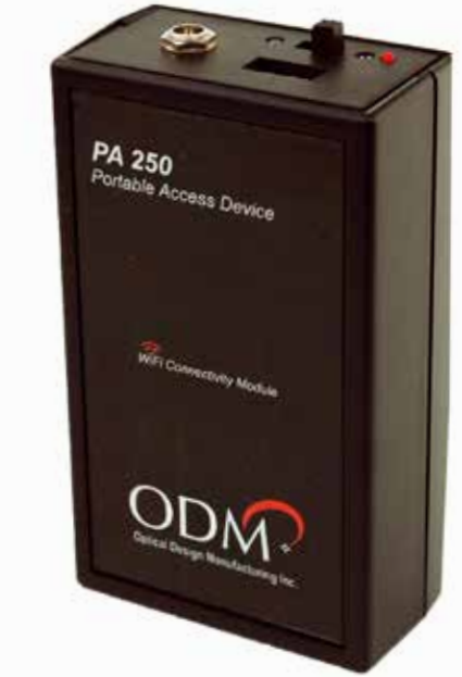
InSpec<sup>™</sup> for Windows included. App for Android & Apple devices available online.