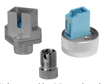
Unit comes with a 2.5mm universal input adapter. Additional adapters are available; see next page for a full list of adapters.