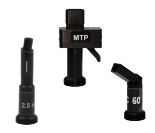
Interchangeable adapter tips provide inspection of many different connector types.