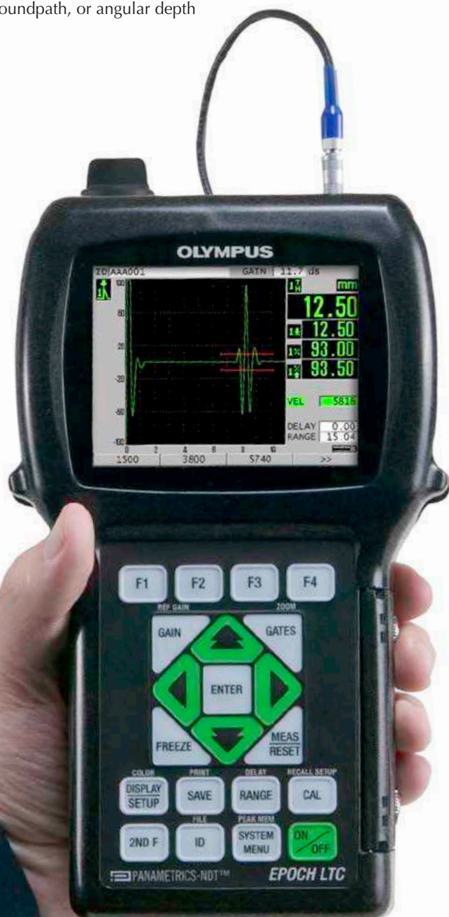
Hand strap can be moved for use with left or right hand