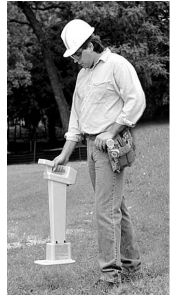
The 3M™ Dynatel™ Cable Locator 2250 can be used with the Dynatel 2205/2206 EMS Marker Locating Accessory.

For cable path locating, the 2250 receiver uses one of four user-selected locating modes – dual peak, dual null, differential or special peak (which increases the sensitivity of the receiver for tracing over longer distances). The mode is selected depending on which is most effective under the locating conditions.