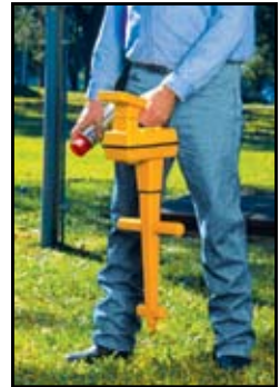
3M™ Dynatel™ Cable/Pipe Locator 2250M

* When connected to standard NMEA compliant GPS devices.