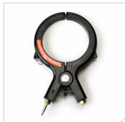
New 4.5 inch Dyna-coupler 4001 Standard on Utility Style Kits