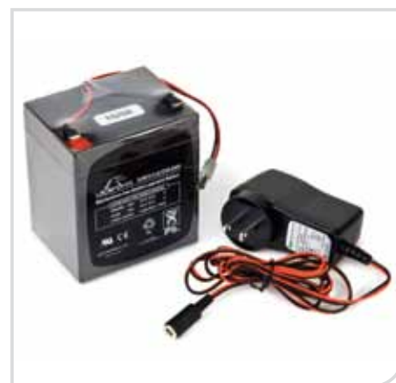
3M™ Rechargeable Battery 2200RB