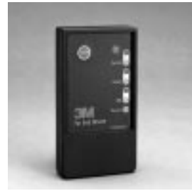
Far End Device