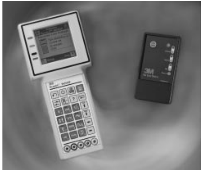
3M Dynatel 965DSP with 3M Far End Device