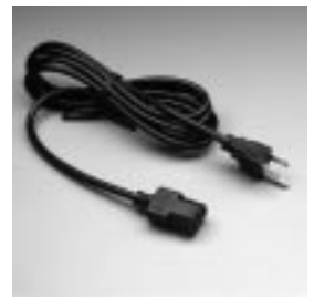
6 AD/DC Adapter Cable