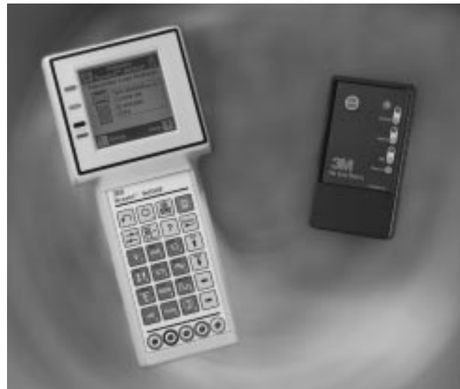
3M Dynatel 965DSP with 3M Far End Device