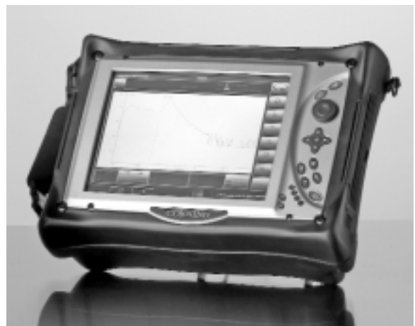
Model 500 Optical Multitester | Photo LAN681