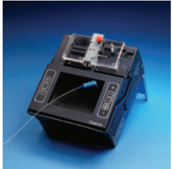
FuseLite II and FuseLite Termination System | Photo SEH122

The new FuseLite II Splicer from Corning Cable Systems provides many enhancements which eliminate the variability in operators’ skill levels. While no longer offering fiber-to-fiber splicing, the completely automatic splicer process provides consistent low-loss results with the added benefit of splice evaluation.