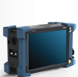
Platform FTB-2/FTB-2 Pro