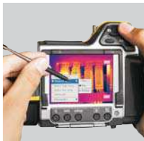
Multifunction Touch Screen