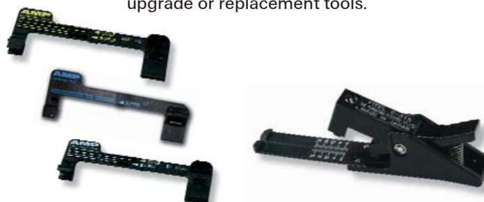
Cable Holders/Templates, SC, LC & ST-Style