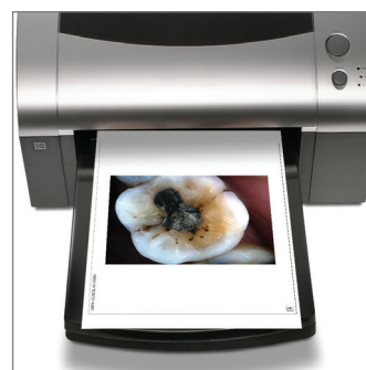
Print the image on any kind of printer.