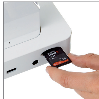
Save the image to your computer or SD card.