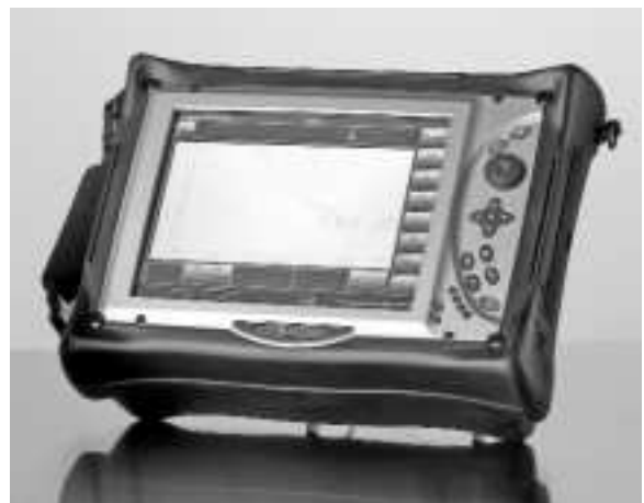
Model 500 Optical Multitester | Photo LAN681