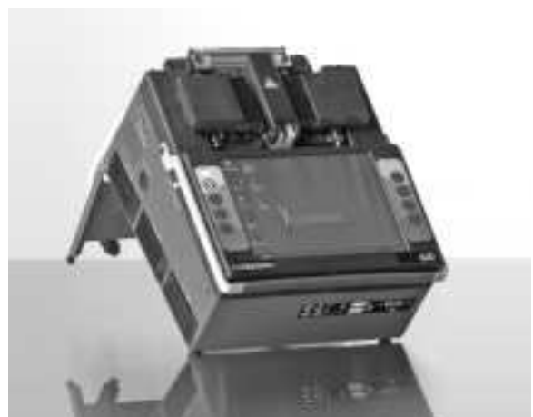
OptiSplice™ Premier iLID Fusion Splicer | Photo LAN680