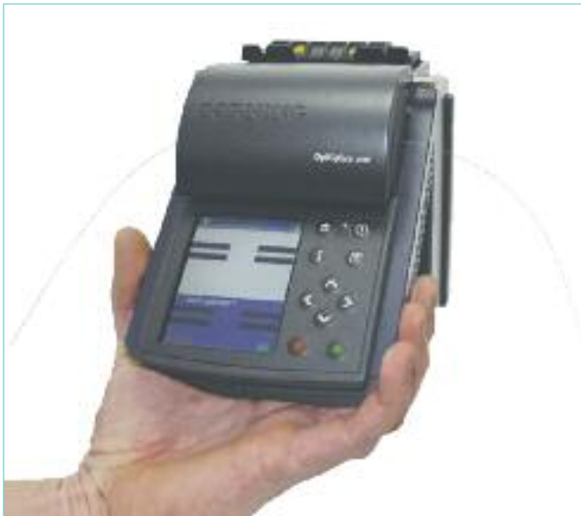
OptiSplice One Handheld Fusion Splicer | Photo LAN1203