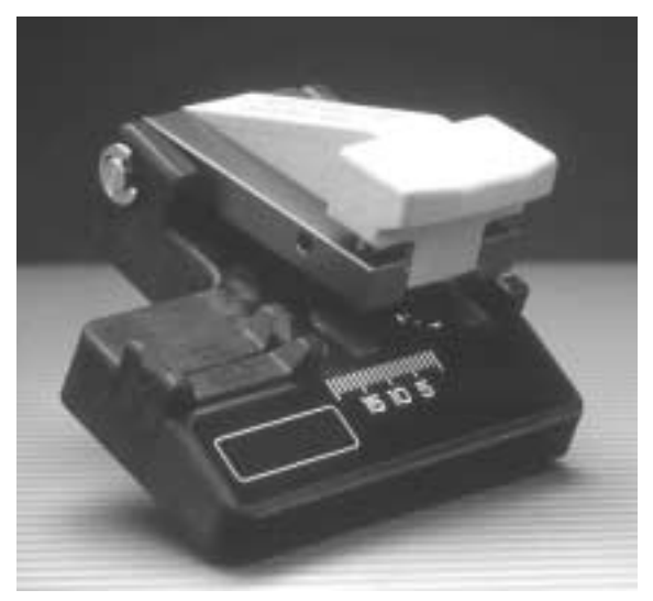
FBC-006 Cleaver | Photo FSP1292