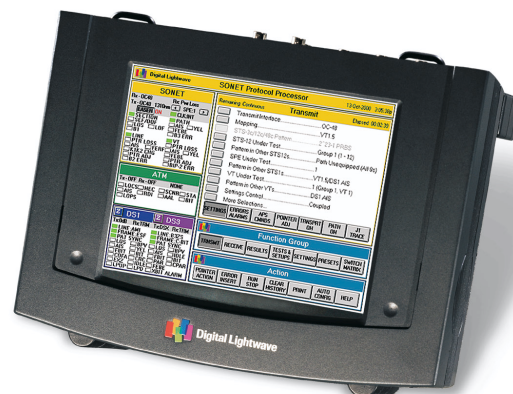
Network Information Computer (NIC ASA 312)

Combining innovative features, functionality and performance into a single cost-effective product, the NIC ASA 312 Network Information Computer is the most advanced testing platform available today.