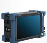
Platform FTB-2/FTB-2 Pro