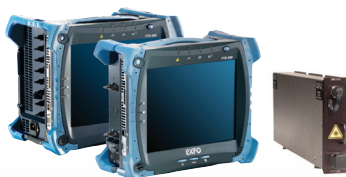
FTB-500 Four- or eight-slot platform for fiber characterization