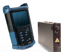
Compact Platform FTB-200