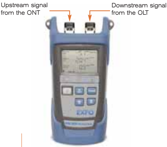
The PPM-352B two-port power meter.

The PPM-351B FTTx-optimized power meter provides filtered measurements and distinct power values for downstream signals (1490 nm and 1550 nm).