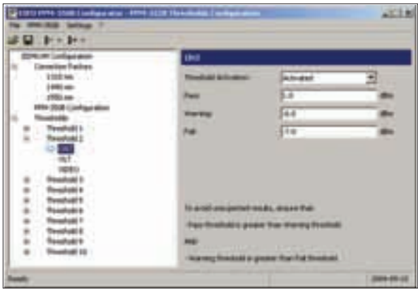
The PPM-350B's threshold configuration software interface.

The PPM-350B performs quick, accurate measurements, no matter where in the network you need to test. What's more, it offers threshold-based pass/warning/fail analysis.