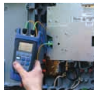
The PPM-350B used at the ONT.