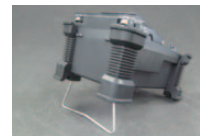
⑤ Angled Stand in Action