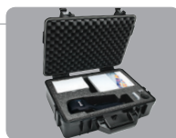
Includes Hard Case