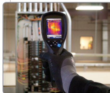
Find Hot Spots Fast!