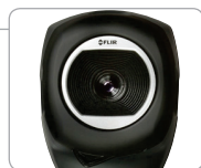
Focus-free Lens for Point-and-Shoot Simplicity