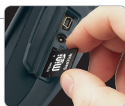
Removable SD Card and USB Output for Fast Image Downloads