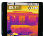
Excellent 2.8" Color LCD Shows the Whole Scene