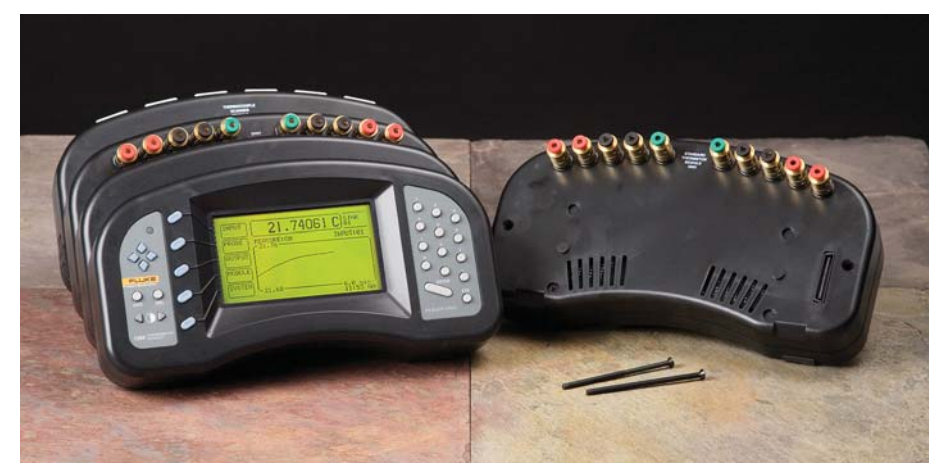
Each module connects and disconnects easily from the Black Stack with just two screws.

This module reads eight channels of two-, three-, or four-wire 100-ohm PRTs or RTDs. The accuracy is \pm 0.01 °C at 0 °C for calibration of industrial sensors. The common industrial RTD can be read with the default values in the CVD temperature conversion for fast setup of industrial applications, or you can enter individual probe constants for higher accuracy data acquisition.