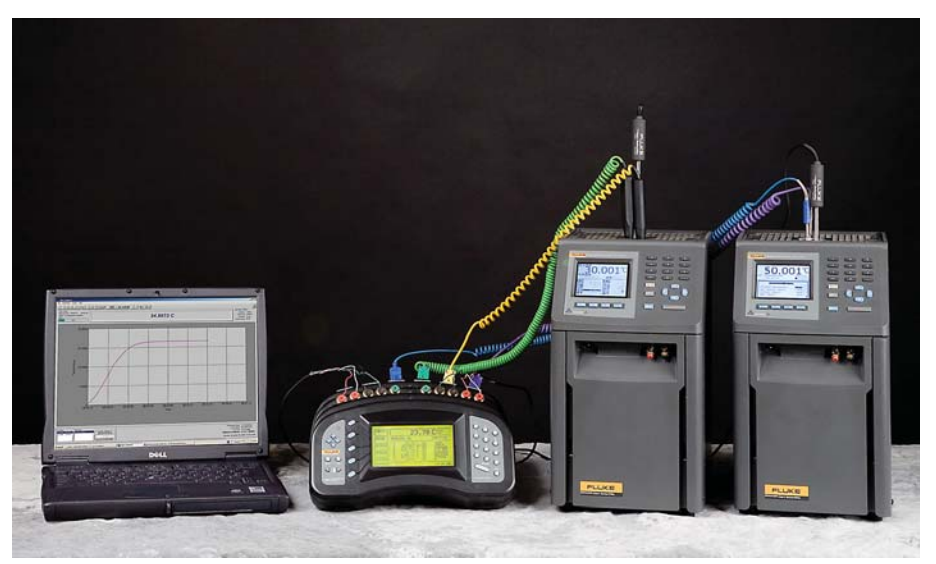
The Black Stack is the perfect foundation to build a totally automated calibration system with Hart heat sources and 9938 MET/TEMP II software (see page 83). No programming or system design nightmares.

1000-ohm PRTs when you can use a Black Stack loaded with convenient temperature functions.