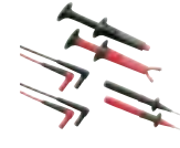
TL220 SureGrip Industrial Test Lead Set See page 57