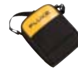
C115 Soft Carrying Case See page 56