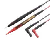
TL175 TwistGuard™ Test Leads See page 59