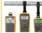
TPAK Magnetic Meter Hanger See page 64