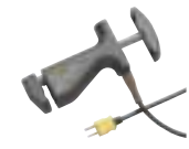
80PK-8 Pipe Clamp Temperature Probe See page 61