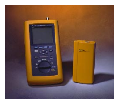
DSP-100 CableMeter main unit and remote.

See the Cable Test Accessories Guide for accessory information