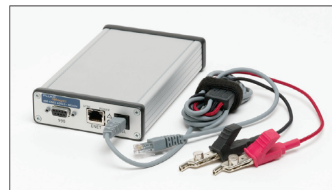
990-GM2 ADSL+ Golden Modem