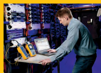
DTX-1800 with DTX 10 Gig Kit to test Alien Crosstalk performance