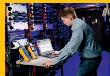
DTX-1800 with DTX 10 Gig Kit to test Alien Crosstalk performance