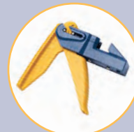
JackRapid™ Punchdown Tool