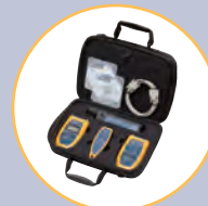
SimpliFiber™ Loss Test Kits