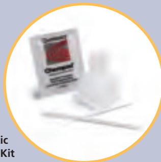
Fiber Optic Cleaning Kit