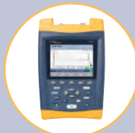
OptiFiber® Certifying OTDR

Check our complete line of SuperVision products like these at www.flukenetworks.com