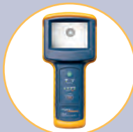
FiberInspector Pro™ Video Microscope