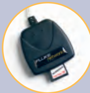
MultiMedia Card Reader