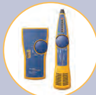
IntelliTone™ Pro Toner and Probe