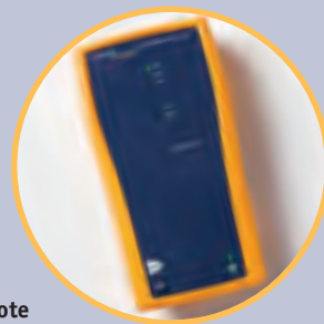
DTX-1800 Smart Remote