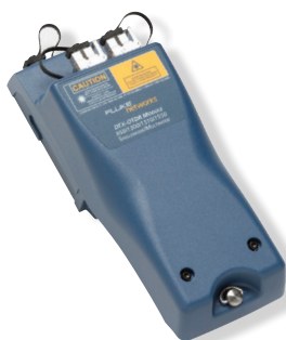
DTX Compact OTDR module