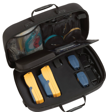
DTX Compact OTDR Kit