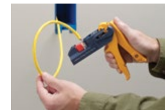
3. Insert jack in JackRapid front first with IDC slots facing blades of JackRapid.