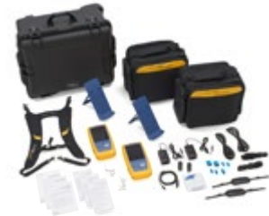
Versiv mainframe and accessories

To learn more visit: www.flukenetworks.com/dsx