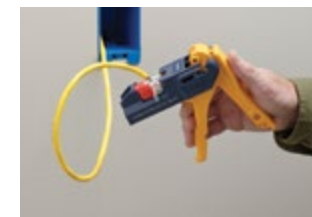
4. Ensure jack is completely and securely inserted in jack holder bed with IDC slots facing the blades.