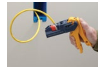
5. Pull trigger completely and remove excess wire prior to releasing trigger.