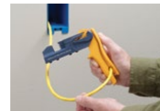
1. Strip cable jacket with a standard cable stripper or the built-in cable stripper.