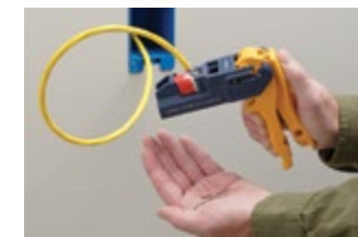
6. Wires will be seated and cut for a solid termination.