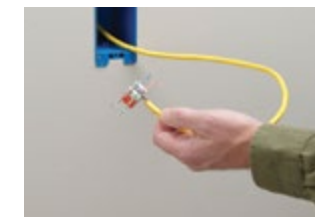
2. Determine wiring scheme. Dress all four pairs (eight wires).