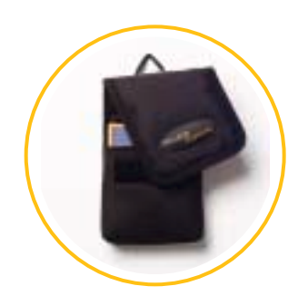
Optional Carrying Case MT-8202-05